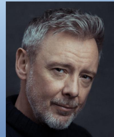
Dave's stepdad, John (John Simm)