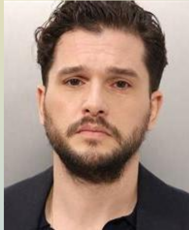
Mel's ex, Dave (Kit Harington)